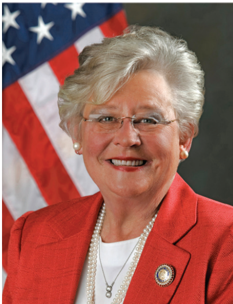
Kay Ivey, Governor of Alabama