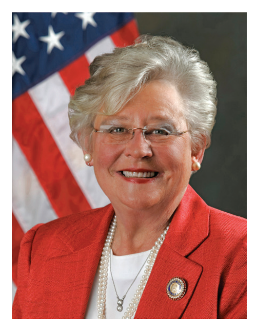
Kay Ivey, Governor of Alabama