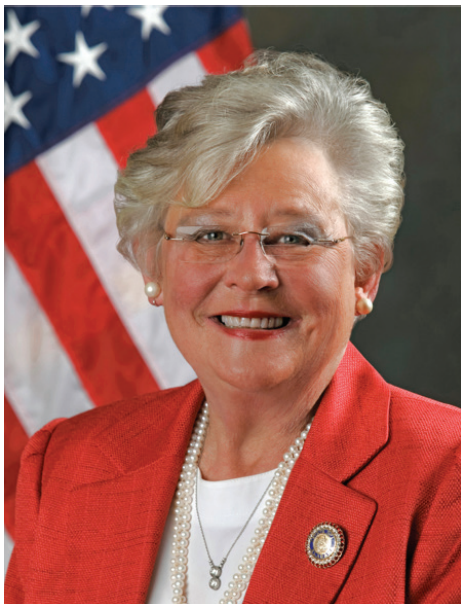
Kay Ivey, Governor of Alabama